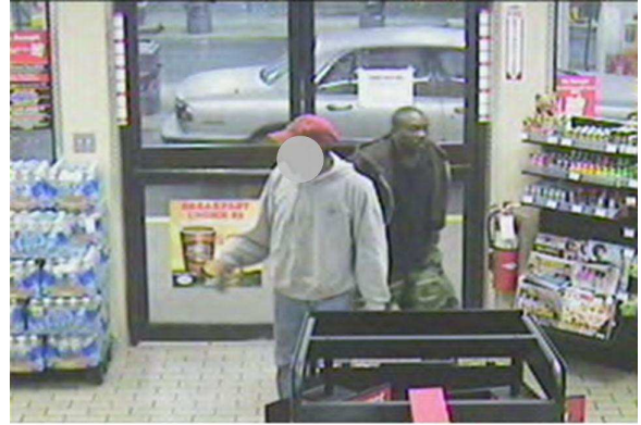
CIRCLE K #5172 Tallahassee, FL