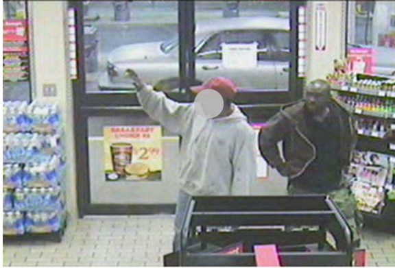
CIRCLE K #5172 Tallahassee, FL