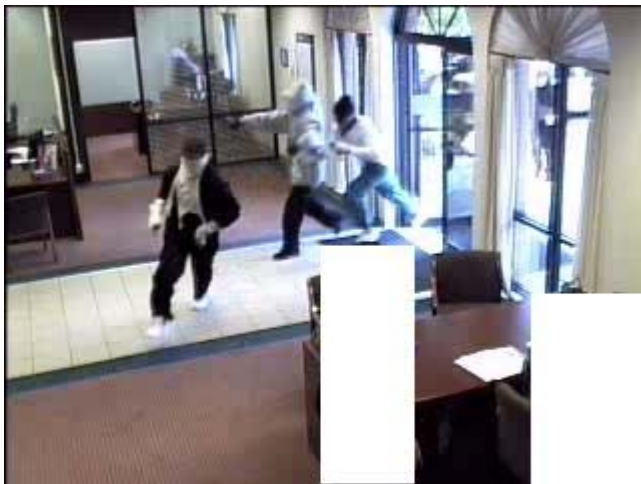
STI-Bradfordville Lobby 1

Violent Crimes Detectives ask anybody that may have information about this crime to contact the Leon County Sheriff's Office at (850) 922-3300 or Crime Stoppers at (850) 574-TIPS (8477). Remember, Crime Stoppers does not want your name, just your information. You could be eligible for a reward of up to $1000.