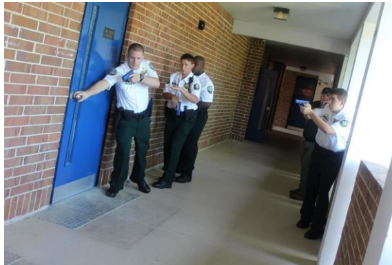
Explorers training on building search tactics.