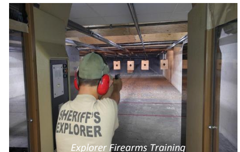
Explorer Firearms Training