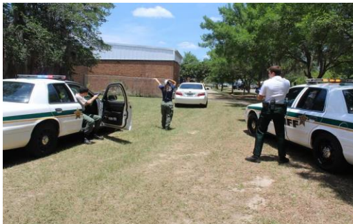
Explorers training on felony traffic stops