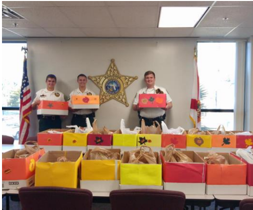
Explorer community service project for Thanksgiving