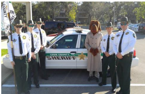
Veteran's Day Parade